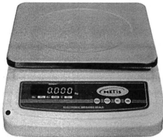
BRAND-METIS Electronic Table top Model-JITJ Class-II